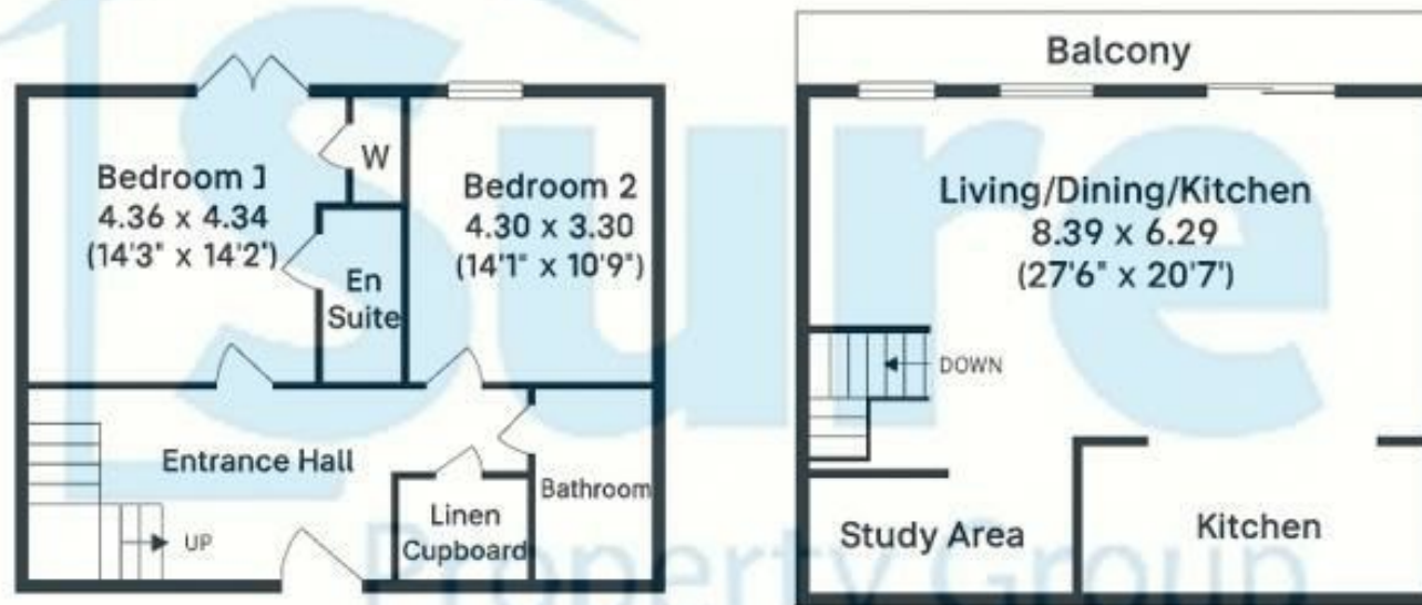
Floorplan for guidance only – not to scale